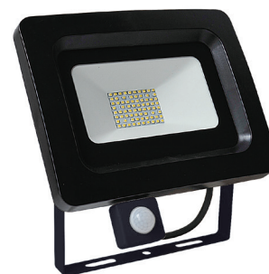
NOVI PIR LED SMD 50W