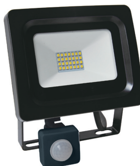
NOVI PIR LED SMD 20W