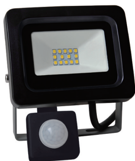
NOVI PIR LED SMD 10W