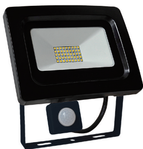
NOVI PIR LED SMD 30W